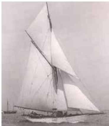
H.P.F. Donegan's 'Gull'.

Jolie Brise won the race in 6 days, 14hrs, 45mins, followed 20 hours later by Gull from Cork.