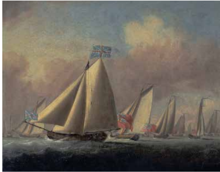
Peter Monamy's 1738 painting of the yachts of the Water Club at sea off Cork Harbour.

The pirate Calico Jack is hanged in Port Royal, Jamaica, The Duke of Savoy trades Sicily for Sardinia with Austria, and the first Piano is made in Italy.