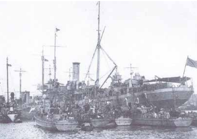
USS Melville tending destroyers and submarine chasers at Queenstown, 1918.

United States joins World War 1 on April 1917 with the first US Destroyers arriving in Cork on the 4th May 1917.