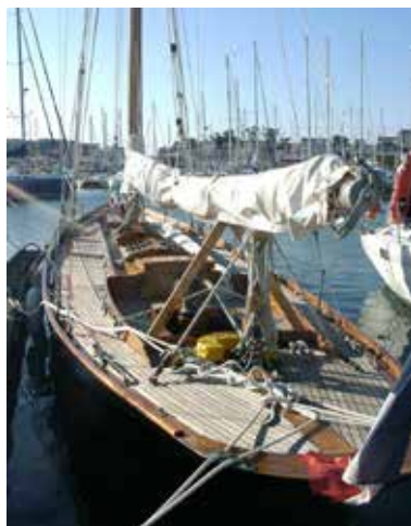
Fife linear rater Pen Duick.